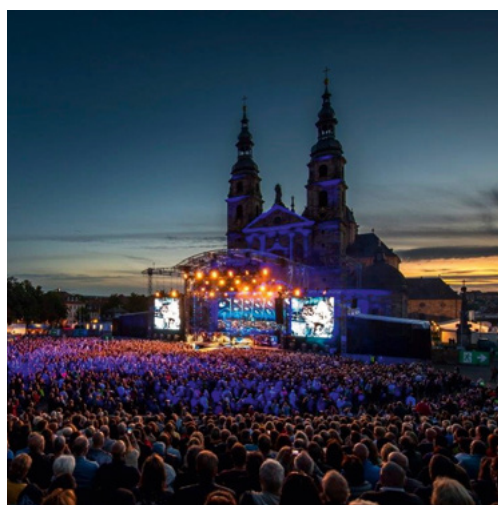
FACHWERK 5 02 | 2024 | Hochschule Fulda